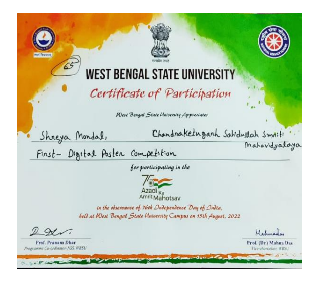
Certificate received by a volunteer from WBSU for her poster

On this phenomenal occasion 10 volunteers adopted few saplings and they regularly take care of them.