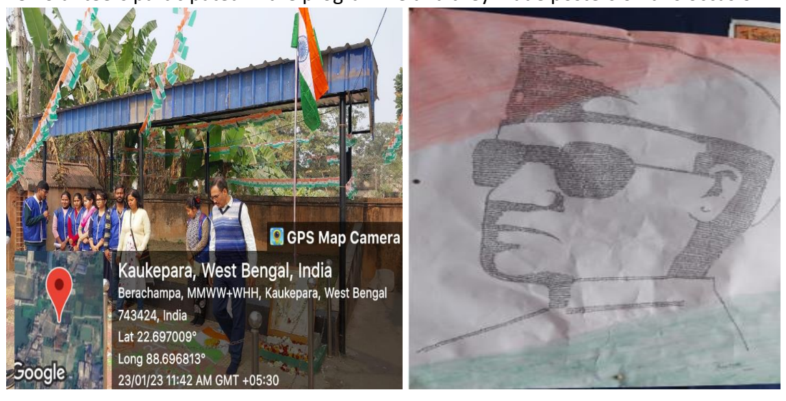
'Netaji' drawn by an NSS Volunteer

On 23<sup>rd</sup> January NSS Unit organized a programme to commemorate 126<sup>th</sup> birth anniversary of Netaji Subhas Chandra Bose. The national flag was hoisted by the Principal and NSS volunteers delivered speeches on the contribution of Netaji in Indian freedom movement. 15 volunteers participated in the programme and they made posters on this occasion.