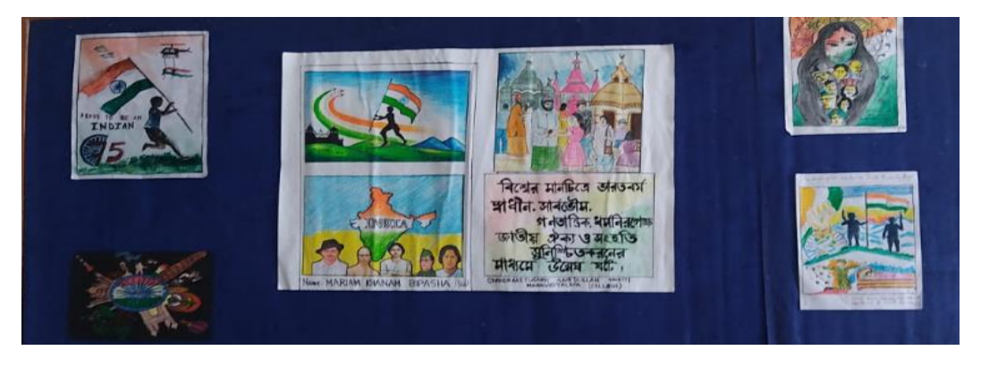
Posters created by NSS volunteers on the occasion of 75th Independence Day